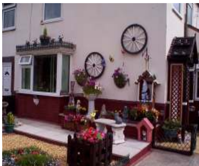
A winning residential garden on Weeton Rd

In addition to the traditional type of gardens, the local judges were impressed by the number of residents who used imaginative ways of providing pleasing appearances to their gardens. An example of which is shown below.