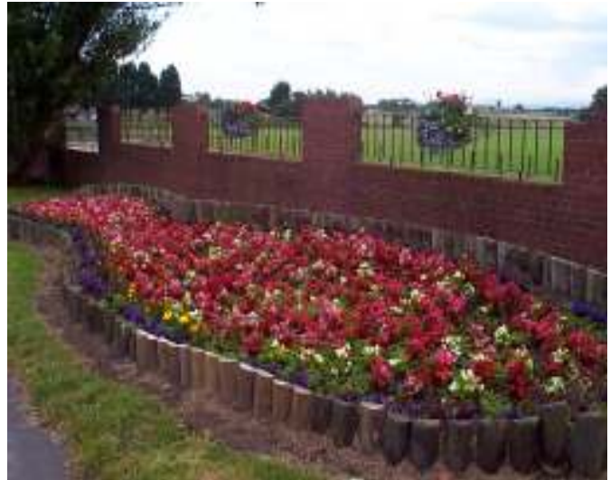
Raised bed at the Fleetwood Road Playing

The frontage to the playing fields is an example where the Town Council have been instrumental in continuing to provide pleasing raised flower beds.