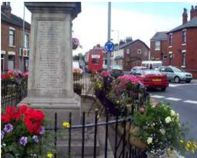
Medlar with Wesham War Memorial

Also in this location the WCPT have developed two specific areas for wild flower development. Whilst there is little to show at the moment, the two areas has had a large number of wild flower seeds sown by the members of WCPT. It is hoped that this will provide a permanent feature and attract butterfly's etc