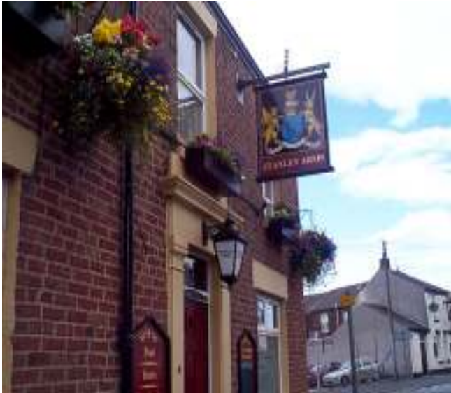
Stanley Arms Garstang Rd South

Throughout the Town, the Council have endeavoured to provide colourful floral displays which have been supplemented by the provision of additional displays by local businesses such as 'The Stanley Arms'