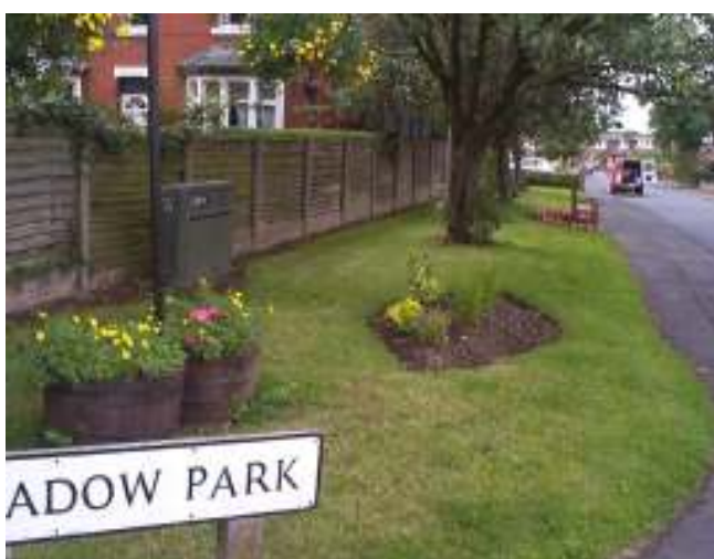
Hanging Baskets and beds at Meadow Park

Towards the end of the season the committee arranged for judging of residential gardens culminating in the presentation of certificates and prizes at a 'Presentation Evening' This was well attended by the Town Councillors, the winners and the committee. The evening was enhanced by the serving of wine and light refreshments and also acted as a publicity platform to reinforce the groups aims.