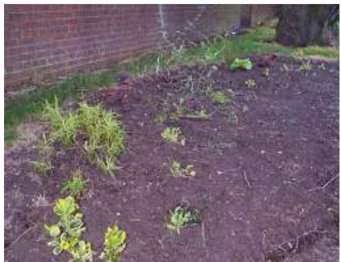
'Experimental' Wild Flower Bed at the Playing Fields