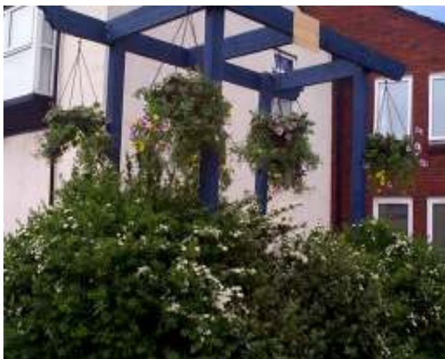
Hanging Baskets and Pergola at Everest Court